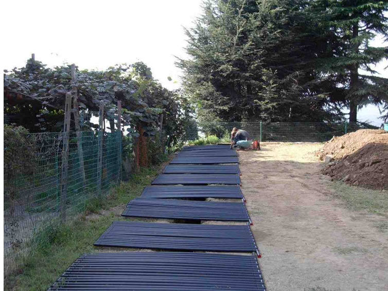
Figure 2: “Compact collectors” installation

running time of approximately 3000 hours/year; recharging of the compact collector takes place through exhaust air recovery and ground collector being interconnected (IVT Industrier ab, 2005). The collector modules are installed in trenches 3m deep and wide as the soil allows up to 0.3m; they are joined together with weld sleeves or screw couplings. Trenches are filled with sand or soft soil without stones. Twenty “compact collectors” modules were joined and installed in the garden in a 3m deep a 0,3m wide trench (figure 2).