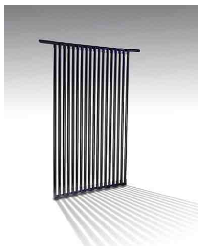
Figure 1: Compact ground heat exchanger

The producer suggests some basic guidelines for a successful installation: the property must be energy efficient with a maximum heat load normally lower than 50 W/m 2 ; the property must be fitted with mechanical exhaust air ventilation and a heat recovery coil must be installed in the exhaust air duct; the heat pump should offer full coverage with a normal